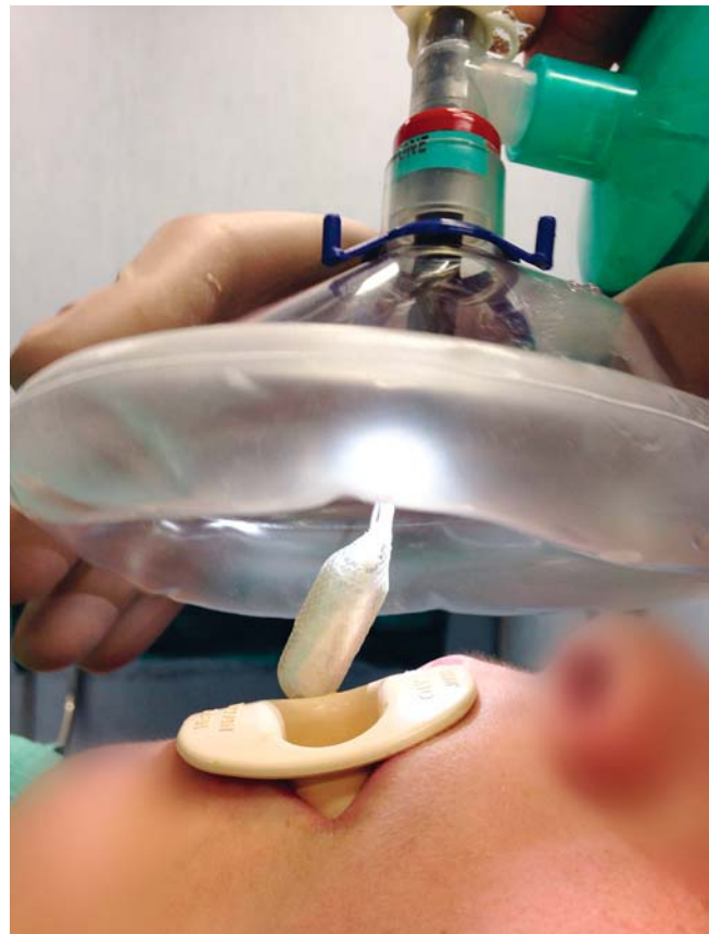
► Fig. 1 Endoscopic insertion of the Obalon.

When an endoscopic placement was necessary, deep sedation was performed using a facial mask to ensure adequate oxygenation during the procedure. Endotracheal intubation should be used only in patients considered at higher risk of respiratory distress. Through a large catheter mount a standard 9.8-mm video gastroscope (Olympus GIF Q165) was passed through the facial mask after being inserted into the working channel of a Roth Net standard retriever for removal of round, blunt foreign bodies (► Fig. 1). The pill was inserted into the basket and the net closed to secure the Obalon during its progression through the esophagus into the stomach. Once the capsule had reached the gastric fundus, it was necessary to wait for it to completely unroll before starting balloon inflation according to the usual technique.