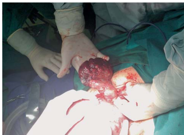
Fig. 2 Cause of acute abdomen in second trimester of twin pregnancy after IVF was five times torquated right ovary, which was revealed by explorative laparotomy.

Laparotomy was performed on the 3rd day of admission (▶ Fig. 2) with access obtained through a Pfannenstiel transverse incision. Intraoperative findings included purulent and hemorrhagic secretions in the abdominal cavity, which were aspirated and sent for microbiological analysis. Inflammatory adhesions involving the entire pelvis were resolved by adhesiolysis. The right ovary was enlarged and necrotic. It was the size of a man's fist, five times torqued and filled the pouch of Douglas. The ovary was removed by right-sided ovariectomy and sent for immediate pathological analysis (▶ Fig. 3). The removed tissue consisting of an edematous torqued ovary with elements of inflammation was confirmed to be hemorrhagic. The left ovary was also covered in adhesions and following ovariolysis it was also shown to be enlarged (the size of a tangerine), consisting of many follicles and corpora lutea. Appendectomy was also done for concomitant catarrhal appendicitis.