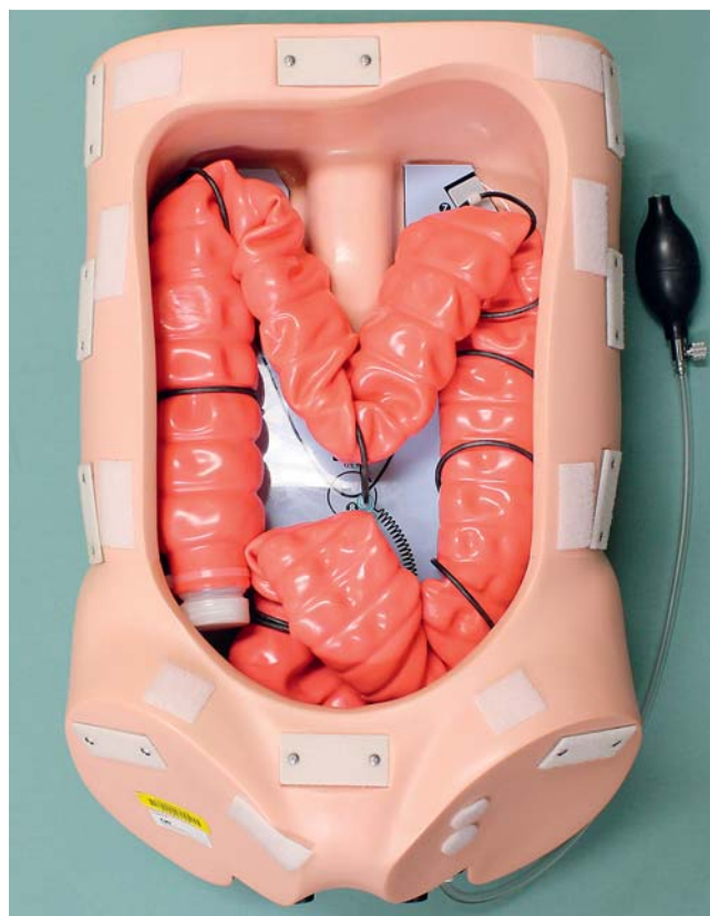
Fig. 1 The Kyoto Kagaku Colonoscope Training Model, without its abdomen cover.

The novice trainees who participated in the current study were 32 first-year medical students with no prior colonoscopy experience. (Assuming that, in the population, the average novice would experience a moderate training effect of 0.5 SD improvement on each outcome measure, power analysis indicated that at least 26 trainees were required for an 80% probability of detecting these effects.) Trainees were recruited and tested between June 2009 and April 2010, and paid AU220 dollars compensation for their time and travel expenses.