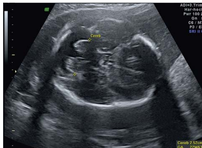
Fig. 2 Fetal ultrasound imaging at 25 weeks of gestation shows hypoplasia of the cerebellar vermis with an enlarged cisterna magna.

endometrial lining was irregular and intracavitary fibroids could not be excluded.