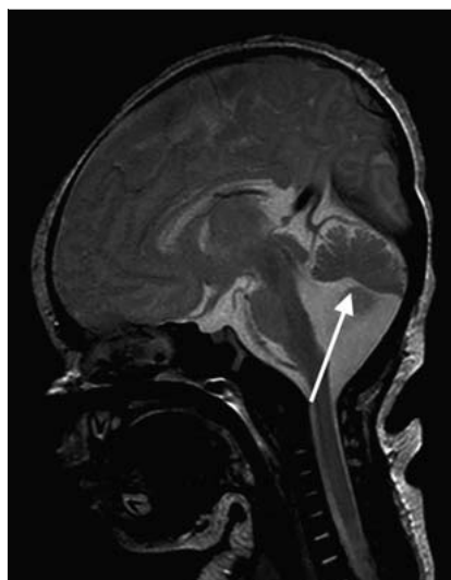
Fig. 3 Neonatal MRI: sagittal T2-weighted image shows hypoplasia of the vermis with malrotation.

According to the patient's menstrual history and consecutive sonographies, the gestational age on the day of the operation was probably around 2 + 6 weeks of gestation p.m. This is consistent with a negative hCG serum concentration (< 2 IU/l) 5 days prior to this date. Neither the hysteroscopic examination, which used saline to distend the uterine cavity, nor the chromoperturbation or the myomectomy with opening of the uterine cavity disrupted the pregnancy. This could be explained by the stable adhesion between blastocyst and early decidua that has been reported for the adhesion phase, even prior to invasion phase of the implantation process. The implantation process involves three key phases: apposition, stable adhesion, and invasion of the blastocyst. The apposition phase is characterized by the start of interaction and attachment between the blastocyst and the apical surfaces of the