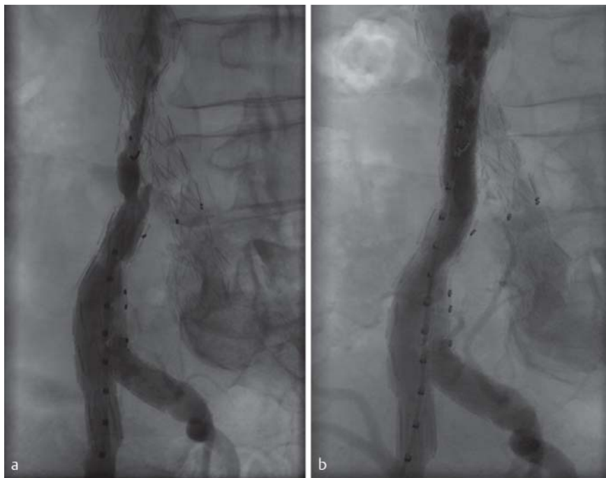
Fig. 2 a Angiography in a 85-year-old man with subtotal thrombotic occlusion of the bridging stent three months after implantation of the ISBD. b After intra-arterial fibrinolytic therapy combined with implantation of a balloon-expandable stentgraft patency is restored successfully.

Abb. 2 a 85-jähriger Mann mit subtotalem Verschluss des „bridging“-Stents drei Monate nach Implantation der iliakalen Bifurkationsprothese. b Erfolgreiche Wiedereröffnung des Lumens nach Kombination aus intra-arterieller Lyse und zusätzlich ballonexpandierbarer Stentimplantation.