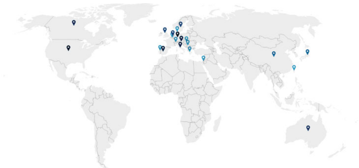
Fig. 1 2021 geographical distribution of Section Editors at Thrombosis and Haemostasis . Map created with Datawrapper.