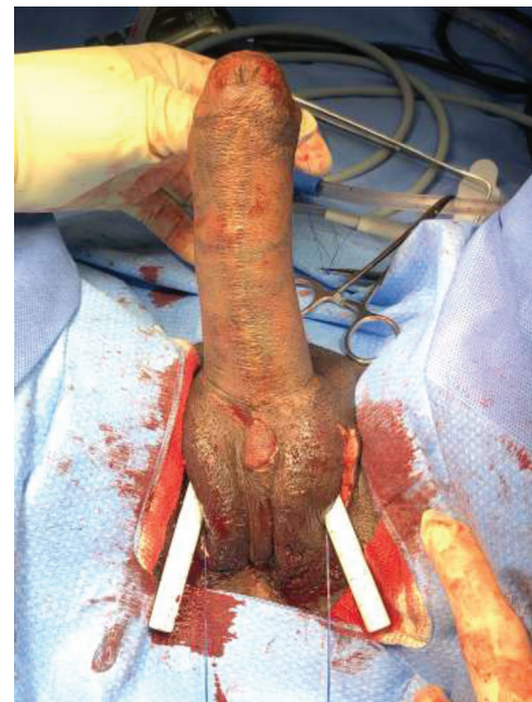
Fig. 1 Malleable penile prosthesis in position prior to proximal ends being trimmed.

Incisions to place the prosthesis can be made ventrally such as an infrapubic incision or dorso-inferiorly such as a parascrotal incision. Surgeons implanting a penile prosthesis after phalloplasty should be conscious of the vascularity of the flap and minimize compromise of this when deciding the location of the incision. For example, the MLD phalloplasty will utilize a flap that requires an anastomosis to the unilateral superficial femoral artery and saphenous vein. 10 Incisions on this side should be avoided when placing the prosthesis. Abdominal phalloplasty is usually based on the superior lateral blood supply to the neophallus. Consideration should be made for an inferior or inferior lateral incision. 11 If the vascularity cannot be determined preoperatively, a Doppler ultrasound can assess the location of the primary vessels. The neophallus may develop accessory