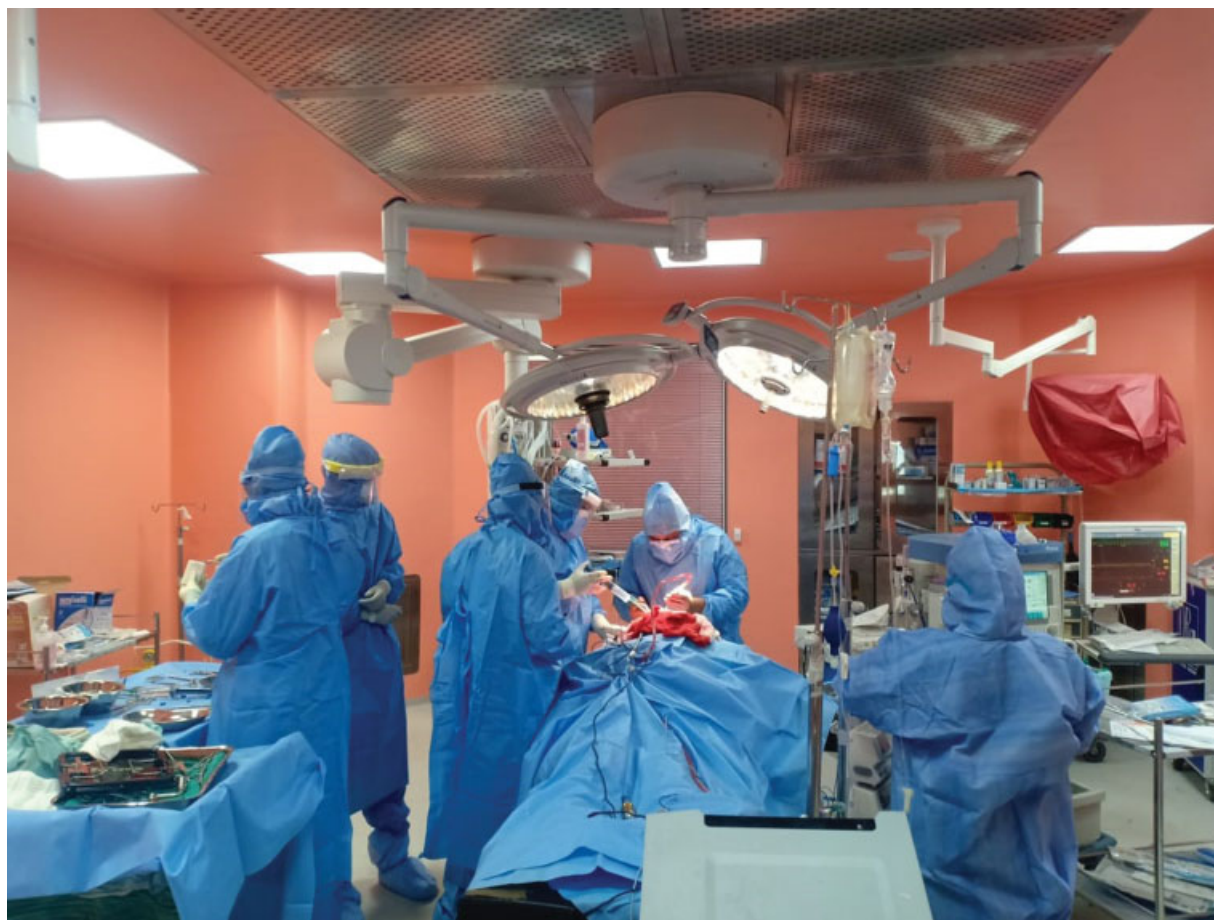
Fig. 3 Surgical team in personal protection equipment in operating room.

of anesthesia was performed with minimum personnel using disposable equipment as per anesthesia guidelines, taking care that the production of aerosols was kept to a minimum. The operating team was advised to keep out of the OR during induction and to enter 15 minutes after intubation. Caution was taken to minimize spillage and contamination by blood or body fluids during operation. The surgical specimen was carefully packed and transported to the pathology department.