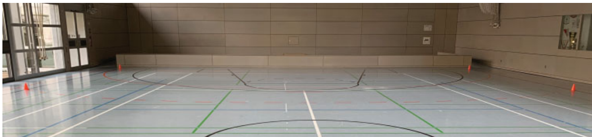
Fig. 2 Photo of the course. The orange line marks the semicircle of Part A.