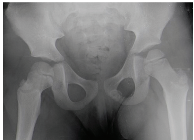
Fig. 1 Radiography of the pelvis (anteroposterior view), revealing a radiopaque image at the level of the left ischiopubic branch, with well-defined contours.

An analytical study, including complete blood count, erythrocyte sedimentation rate (ESR), and C-reactive protein (CRP), revealed no major changes. A pelvic radiography showed a radiopaque image, about 1.8 × 1.4 cm in size, with well-defined contours, at the level of the left ischiopubic branch (► Figures 1 and 2 ). For etiological clarification, an MRI of the pelvis was performed, which showed edema at the level of the left ischiopubic synchondrosis, with no abnormalities in the adjacent soft tissues (► Figure 3 ).