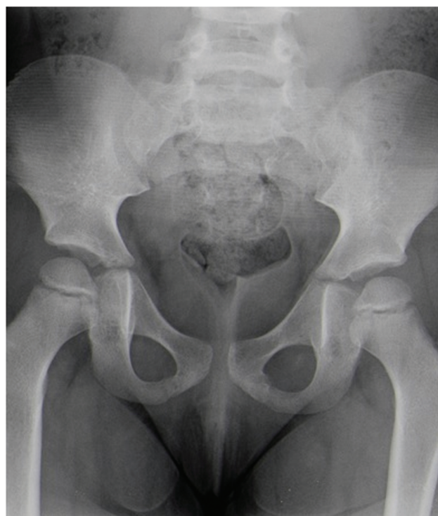
Fig. 4 Radiography of the pelvis (anteroposterior view), revealing complete recovery.

Lameness is a frequent complaint in the pediatric population. Its differential diagnosis is very challenging due to the multiple potential etiologies, which vary according to the age group. In children with unilateral inguinal pain and