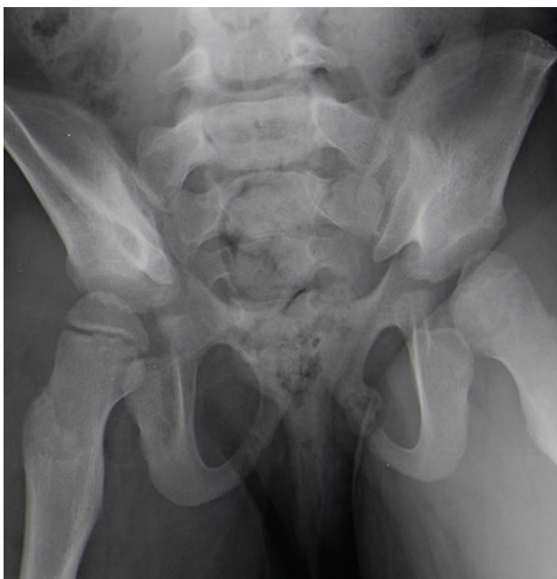
Fig. 2 Radiography of the pelvis (outlet view).