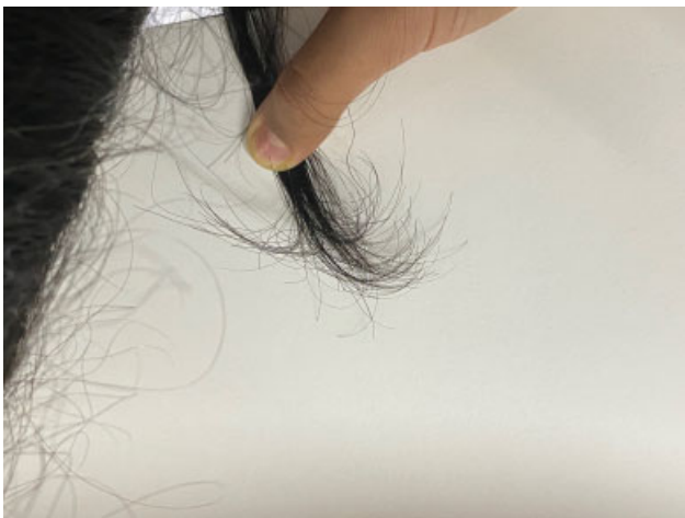
Fig. 2 Card test.