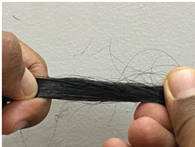
Fig. 4 Tug test.

follicles and a part of subcutaneous fat tissue. It is preferable to harvest two 4-mm biopsy specimens for the horizontal and vertical sectioning. Horizontal sectioning helps to evaluate the follicle at various levels, and vertical sectioning helps to evaluate the entire follicle. 11