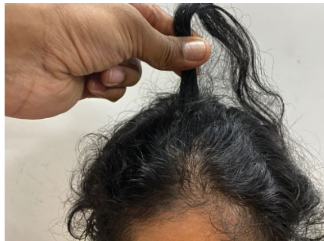
Fig. 3 Hair pull test.

abnormalities. 1 Epilated hairs are mounted on the slides with a mounting medium and a coverslip on the top, and the characters are examined under the light microscope. Trichoscopy has made hair mount test less significant nowadays.