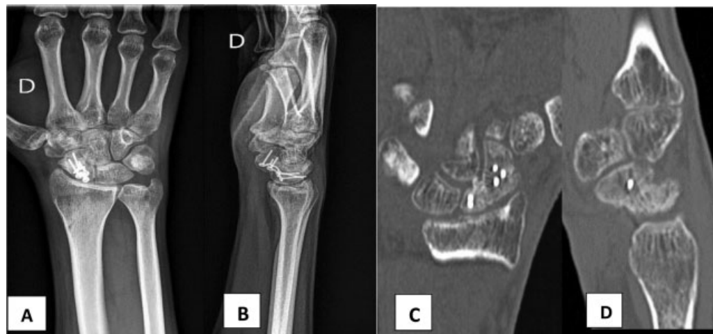
Fig. 2 Three months after surgery. (A) Anteroposterior radiograph showing a well-placed plate and consolidated pseudoarthrosis. (B) Lateral radiograph showing total integration between the fragments. (C) Frontal section of a computed tomography (CT) scan showing a bone bridge between the fragments. (D) Lateral CT image showing consolidation of pseudoarthrosis.

Abbreviations: CLPS, contralateral lateral pinch strength; EXT MCP THUMB, extension of the metacarpophalangeal joint of the thumb; FLEX MCP THUMB, flexion of the metacarpophalangeal joint of the thumb; LPS, lateral pinch strength; PREOP, Preoperative; RADIAL ABD THUMB, radial abduction of the thumb; RADIAL DEV, radial deviation; REST VAS, visual analog scale for pain at rest; ULNAR DEV, ulnar deviation; VAS ROM, visual analog scale for range of motion; W EXT, wrist extension; W FLEX, wrist flexion.