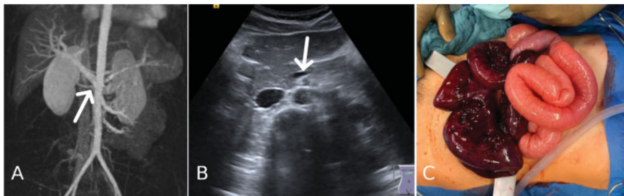
Fig. 2 Contrast-enhanced magnetic resonance angiography demonstrated a slight ventralization of the venous confluence in front of the mesenteric artery (arrow) (A). B-mode ultrasound showed a slight clockwise ventralization of the superior mesenteric vein (arrow), which normally lies to the right of the superior mesenteric artery (B). Midline laparotomy revealed a 360 degrees-volvulus involving ~115 cm of ileum up to 10 cm proximal of the ileocecal valve with marked intestinal ischemia. The cecum and colon were in their normal anatomical position (not shown) (C).

necrosis, or perforation of the affected bowel segment, with possible consequences like short-bowel-syndrome and death. 3 Unlike midgut volvulus secondary to malrotation, which is most common in the neonate and young infant, segmental SBV is known to occur at any age. 5 Annual incidence of SBV is reported to be 1.7 to 5.7 per 100,000 adults in Western countries, and 24 to 60 per 100,000 adults in Africa, the Middle East, and Asia. 3,4 Though primary SBV accounts for 31 to 100% of cases of SBV in case studies performed in certain Asian, African, and Middle Eastern countries, it is extremely rare in Europe and North America, accounting for an estimate of 0.1 to 0.22% of hospitalizations for bowel obstruction. 3,4 This difference in incidence is not fully understood, though it has been attributed to differences in dietary habits. 3 Information about segmental SBV in school-age children and adolescents is especially scarce and derived mostly from single case reports and small case series, which have usually featured children younger than 5 and older than 15 years. 3,6–10