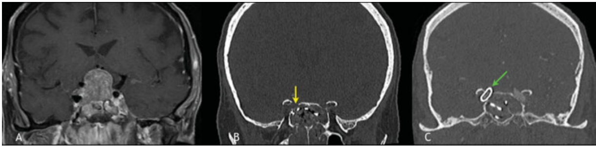
Fig. 1 (A) Coronal MRI of the brain with contrast demonstrating sellar and suprasellar mass with significant elevation of the optic apparatus, chiasmatal compression, and invasion of the right cavernous ICA. (B) Coronal CT without contrast demonstrating bony defect at the ICA injury site (yellow arrow). (C) Coronal CT angiogram with contrast demonstrating PED covering the ICA injury (green arrow), with normal position/nonectatic anterior genu of the ICA. CT, computed tomography; ICA, internal carotid artery; MRI, magnetic resonance imaging; PED, Pipeline embolization device.

with Pipeline embolization device (PED) and endoscopic endonasal repair using a fascia lata/muscle graft to treat an ICA pseudoaneurysm.