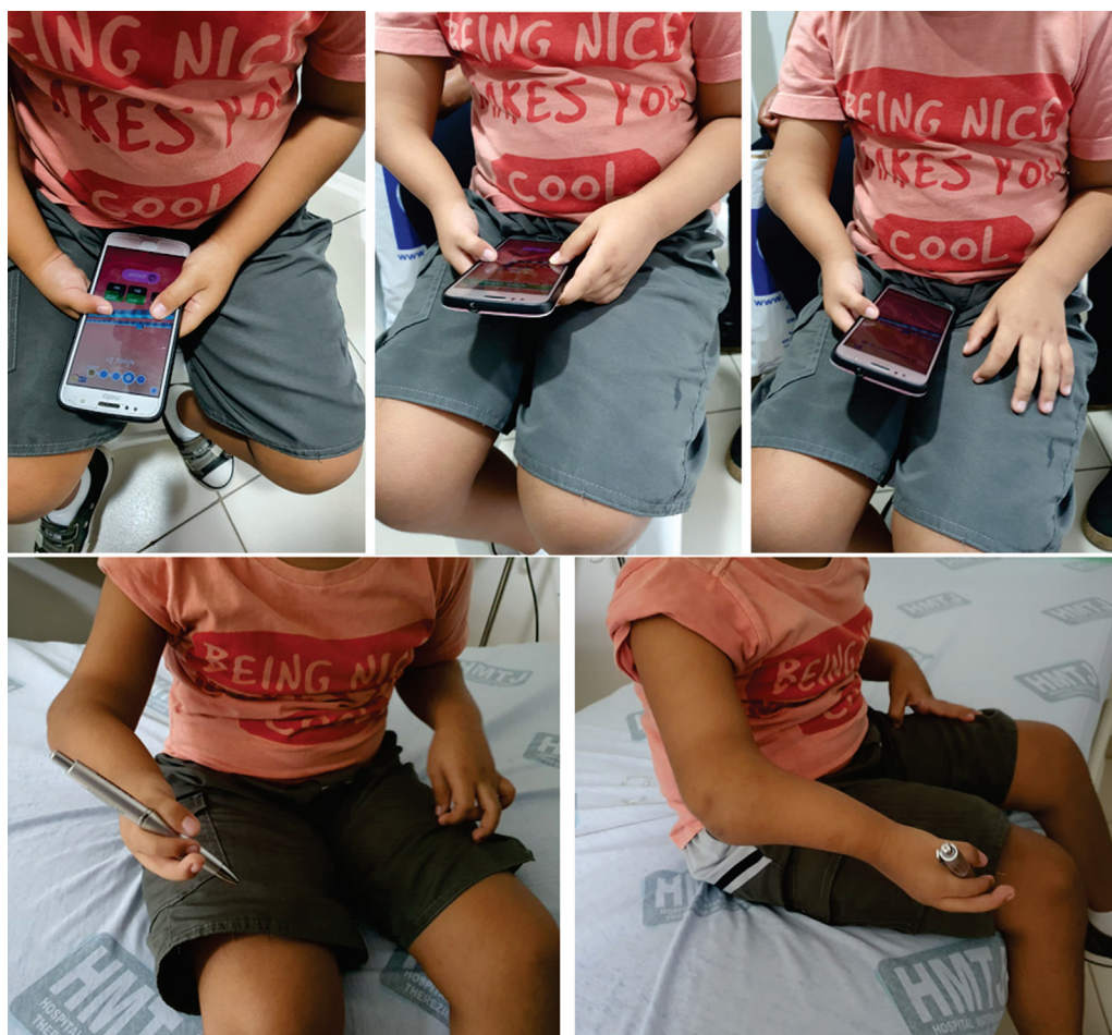
Fig. 3 Illustrative images of limb functionality using electronic device and demonstrating clamp function.

To evaluate the gain of function, we can use objective scales (e.g. DASH) or other more subjective scales (e.g.: GAS). Although validated, the DASH questionnaire has disadvantages because it involves a longer period of application and is specific to adults. Therefore, GAS is preferred by us, because it is more practical. It involves defining a set of objectives and specifies a range of possible outcomes for each objective (on a scale that contains 5 levels, from -2 to +2). It is used to evaluate performance after a specified intervention period. 7