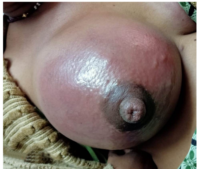
Fig. 1 Massive enlargement of the breast, with the overlying skin being red and hot.

Chemotherapy was planned. Complete blood count and peripheral smear were repeated. The total leukocyte count was 1 lakh. The significant findings were presence of 80% blasts. Platelets had decreased in number. Hence, a clinical