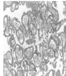
Fig. 3: Histopathology slide photograph showing areas of hydatidiform mole