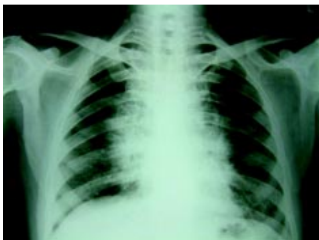
Fig-1 Chest X-ray showing bilateral perihilar infiltrates.