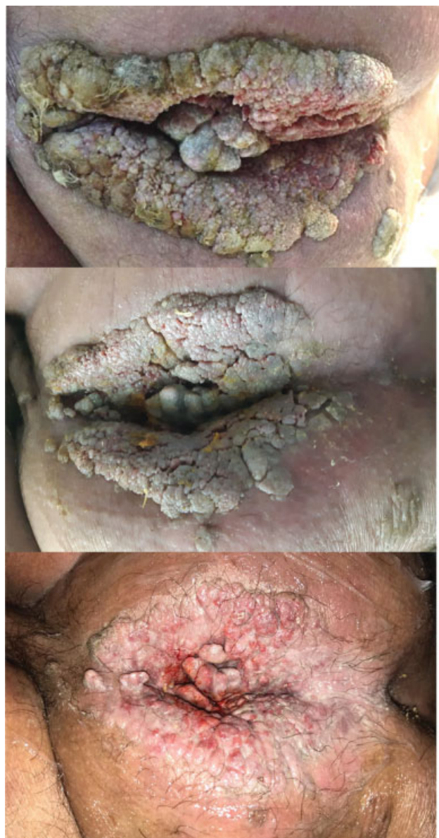
Fig. 2 Partial response.