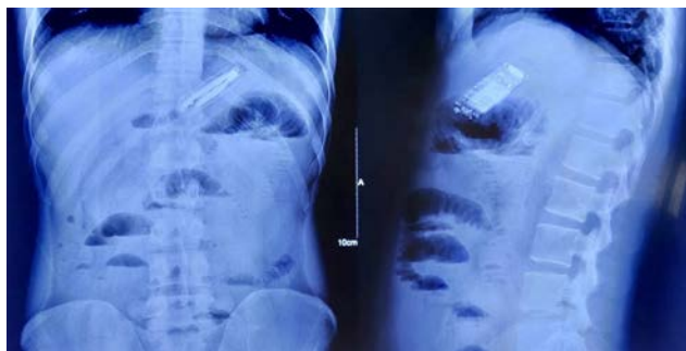
Fig. 1 X-ray abdomen showing foreign body, most likely a mobile phone.