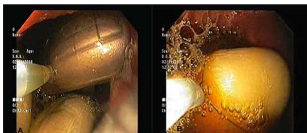
Fig. 3 Endoscopic removal of mobile phone (A) and drug packets (B) done with snare.