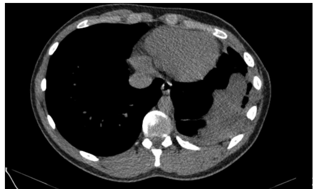
Fig. 4 An intrathoracic heterogeneous solid mass with undulant borders.

A 19-year-old male reached out to our outpatient clinic with wound discharge. Following a stab wound 6 months prior, he had had an emergency thoracotomy and a laparotomy simultaneously. The complaint was a purulent discharge from the chest drain's incision scar. The otherwise healthy patient had a diagnostic CT (►Fig. 4), which showed no visible radiopaque marking in the foreign body, but considering the patient's operation history and wound discharge, the preliminary diagnosis included gossypiboma and empyema. Surgery for sponge excision and decortication for empyema was performed and pathological examination confirmed the diagnosis. He was discharged on the fifth day after an uneventful postoperative course.