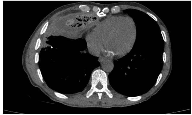
Fig. 3 A paracardiac gossypiboma in its characteristic spongiform appearance.

A 65-year-old male consulted our clinic for purulent wound discharges from two cutaneous fistulas on the xyphoid and right lateral chest wall. The patient had suffered from continuous wound discharges for 15 years, after a mitral valve replacement surgery that had taken place at that time. Gossypiboma was the preliminary diagnosis, and a chest CT