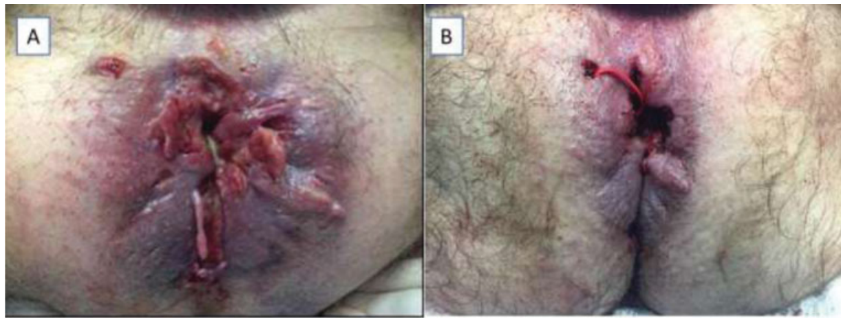
Fig. 2 (A) Perianal Crohn's disease with complex fistula, ulcerations and skin tags; (B) Seton placement in complex anal fistula after anorectal EUA.