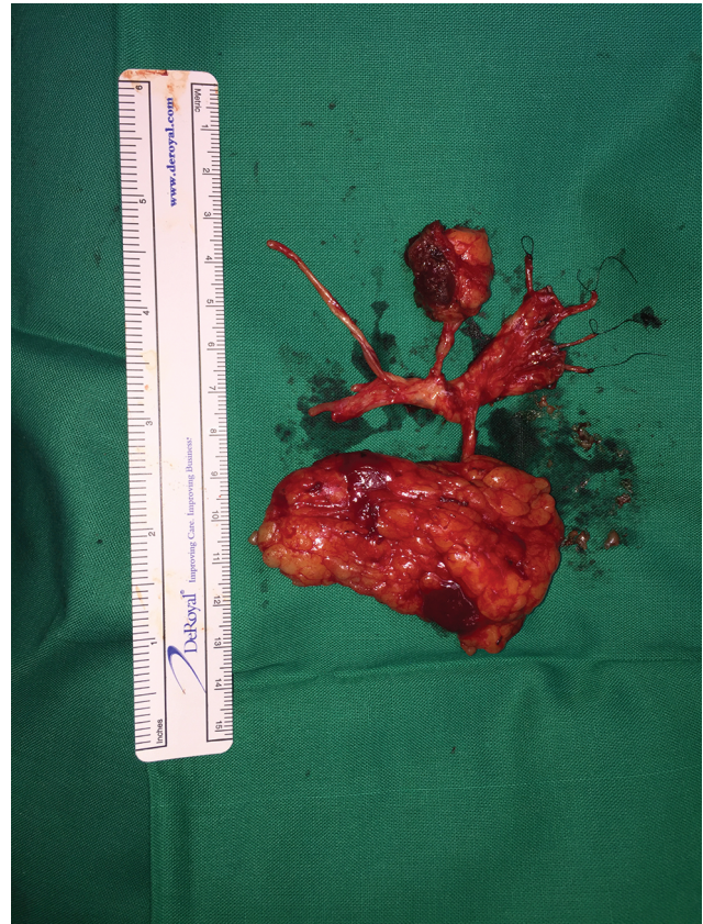
Fig. 2 A composite free flap from the lateral circumflex femoral vessels, including two soft-tissue islands and a 13-cm-long segment of the motor nerve of the vastus lateralis with five distal branches, was elevated from the right side.