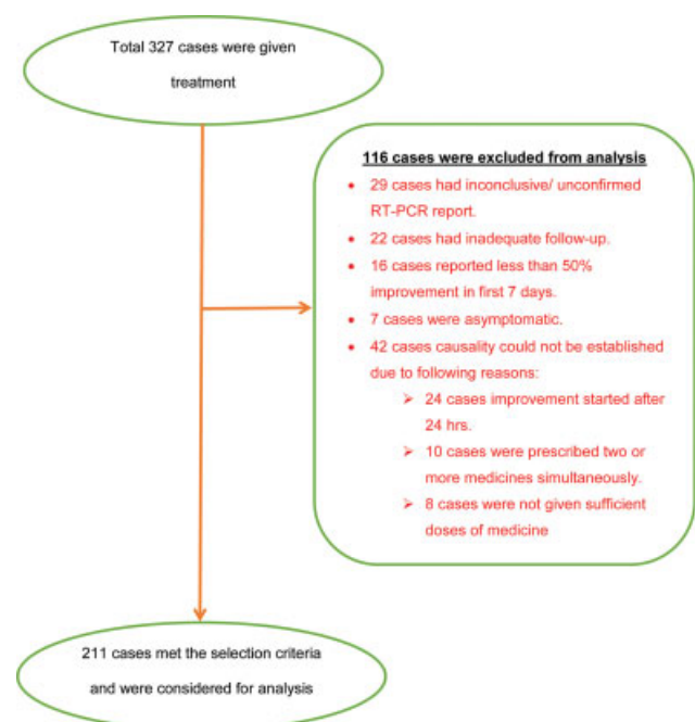
Fig. 1 Flowchart of the study.