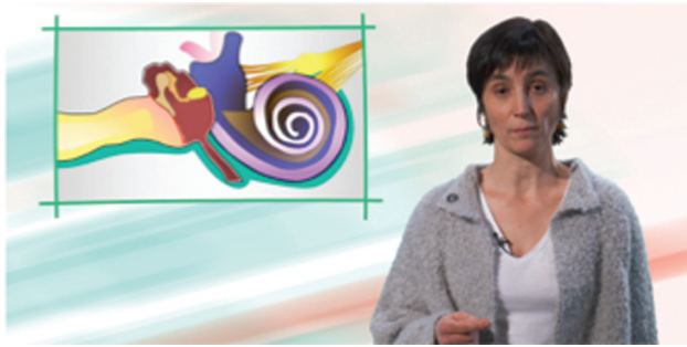
Fig. 1 Illustration of hearing in the module 8 “protect your hearing.”