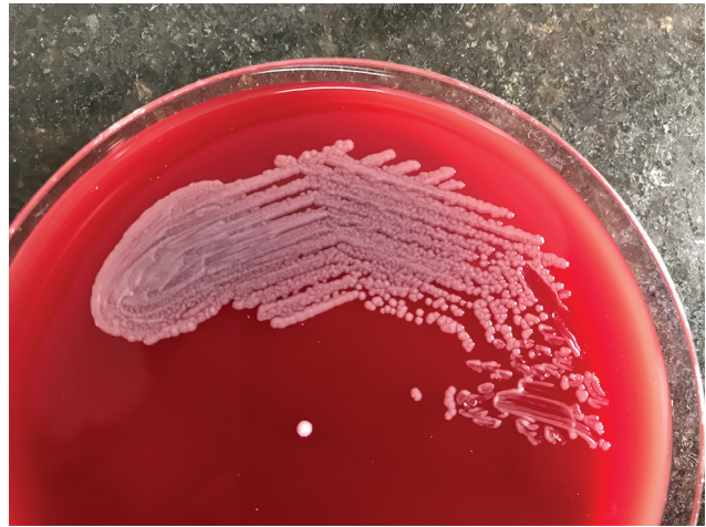
Fig. 2 Growth of smooth, circular, grayish-white, nonhemolytic colonies on blood agar.