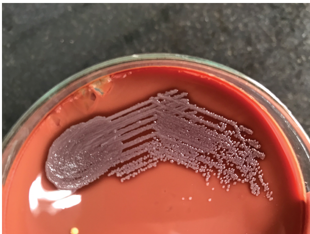
Fig. 1 Growth of smooth, circular, grayish-white colonies on chocolate agar.

The CSF was slightly turbid with TLC 427 cells/ \text{mm}^3 , DLC N96L02M02, glucose < 3 mg/dL, and protein 167 mg/dL. The CSF Gram stain showed few pus cells and plenty of short slender Gram-negative bacilli. On the next day (day +1), chocolate agar showed heavy growth of 1 to 2 mm smooth, circular, grayish-white colonies ( Fig. 1 ), grayish-white, nonhemolytic colonies on blood agar ( Fig. 2 ), and nonlactose fermenting semitranslucent colonies MacConkey agar ( Fig. 3 ). The isolate was Gram-negative bacilli, both catalase and oxidase positive and nonmotile. The neonatologist was