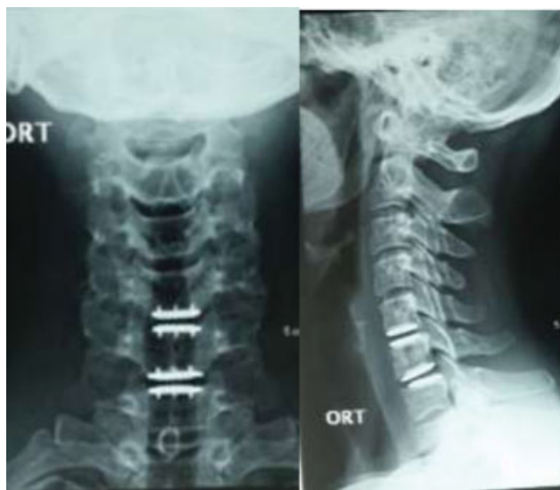
Fig. 3 Cervical disc arthroplasty. (A) Radiography in anteroposterior incidence; (B) Profile radiography.

Numerous models of prostheses, whether constrict, non-constrict and semi-constrict; made of metal-metal or polyurethane nuclei, all of them maintain the same indications of anterior cervical arthrodesis, presenting the following contraindications: surgery at three or more levels, cervical instability, osteopenia, active infection, and kyphotic deformity. 31