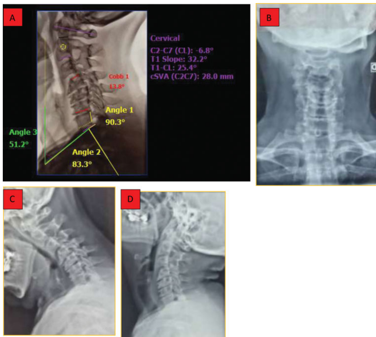
Fig. 1 Radiographic parameters of cervical sagittal alignment. (A) Profile radiography with measurements of sagittal alignment of the cervical spine; (B) Radiography in anteroposterior incidence; (C) Radiography in profile with cervical flexion; (D) Radiography in profile with cervical extension; (E) Computed tomography of the cervical spine; (F-G) Magnetic resonance imaging of the cervical spine.