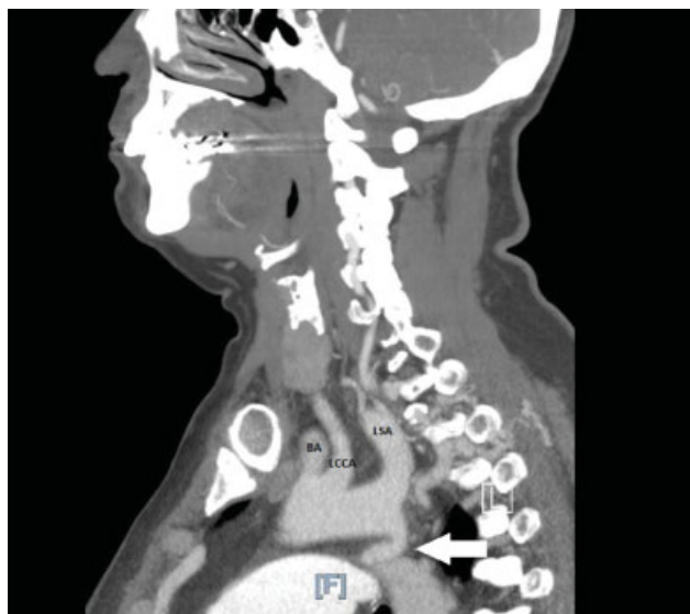
Fig. 1 Computed tomography angiography notable for aortic coarctation with narrowing of aortic lumen distal to origin of left subclavian artery. White arrow pointing at site of coarctation. BA, brachiocephalic artery; LCCA, left common carotid artery; LSA, left subclavian artery.

narrowing resulting in increased left ventricular afterload and hypertension proximal to the obstruction with decreased flow distal to the obstruction. 1 Dyspnea, fatigue, headache, and hypertension are the most common presenting signs reported in the literature. 1–3 Physical examination findings consisting of decreased or absence femoral pulses can aid in the diagnosis.