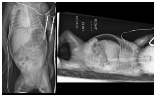
Fig. 1 AP and left lateral decubitus abdominal radiograph demonstrating pneumoperitoneum. AP, anteroposterior.

An abdominal X-ray obtained due to increased frequency of bradycardias, bilious aspirate, and abdominal distension demonstrated a large pneumoperitoneum and dilated bowel loops (→ Fig. 1). The arterial blood gas was unremarkable with