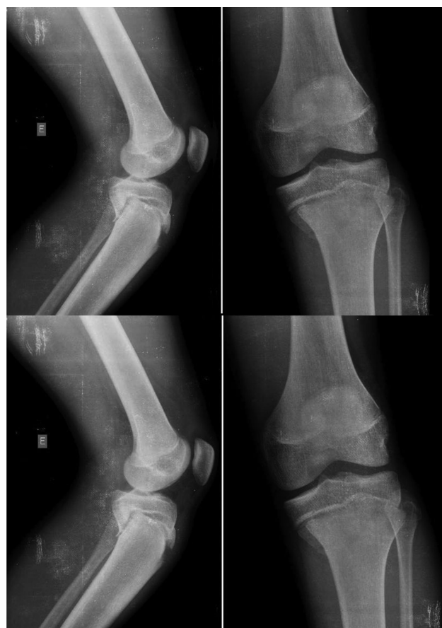
Fig. 1 Anteroposterior and lateral radiographs of the left knee showing avulsion fracture of the tibial tuberosity.

The physis, which is not as stiff as the remaining bone tissue, is an area of the immature skeleton highly susceptible to injury. Since excessive physical activity increases the physal