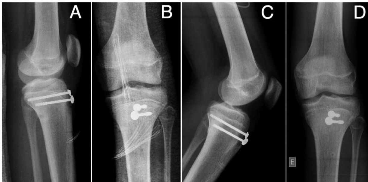
Fig. 2 Anteroposterior and lateral radiographs at the immediate postoperative period (A,B); anteroposterior and lateral radiographs three months after surgery (C,D).