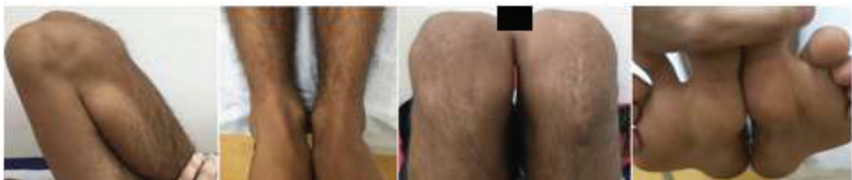
Fig. 4 Clinical images one year after surgery.