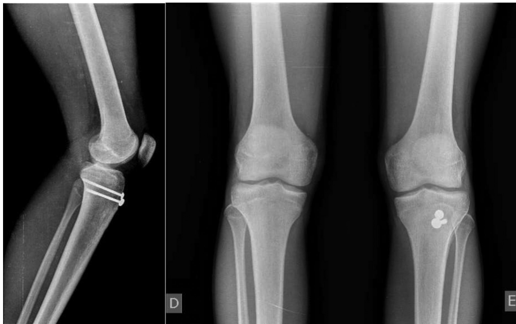
Fig. 3 Radiographs one year after surgery.