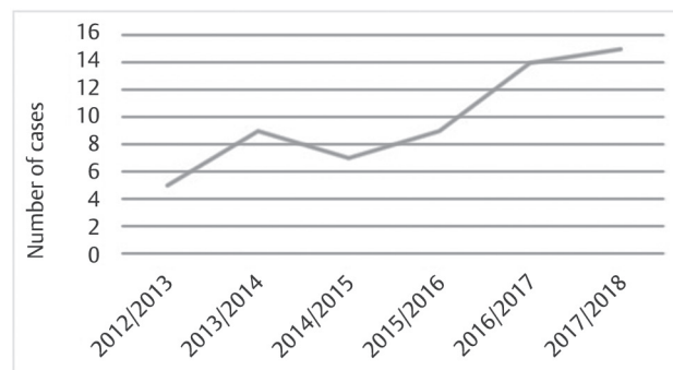
Fig. 2 Incidence for head and neck neoplasms over the period 2012 to 2018.

be known for a few decades. Themes commonly used in antismoking messages may be effective in educating the public about the potential harm of e-cigarettes. 23