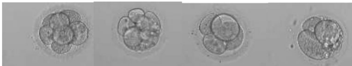
Fig. 1 Embryos with 100, 80, 60, and 40 points according to the graduated embryo score.

Absolute data were analyzed with the chi-square test or Fisher exact test. Continuous variables were compared using the Student t -test or analysis of variance (ANOVA). Multivariable analysis was done using linear or binary regression, controlling embryo score for endometriosis, body mass index (BMI), age, infertility length and number of retrieved oocytes. Data were analyzed using the SPSS Version 18.0 software package (SPSS Inc., Chicago, IL, USA). Significance was set at p < 0.05 . Sample size was calculated from a pilot study conducted in 2009, and 70 patients were needed to have a 90% chance of detecting, at a 5% significance level, a decrease in the primary outcome measure from 92 in the control group to 85 in the experimental group. 18 In this pilot study, developed by Genro et al. (2009), 11 a GES value of 92 \pm 12 was recorded in the control group without endometriosis, compared with 85 \pm 9 in those infertile patients with endometriosis.