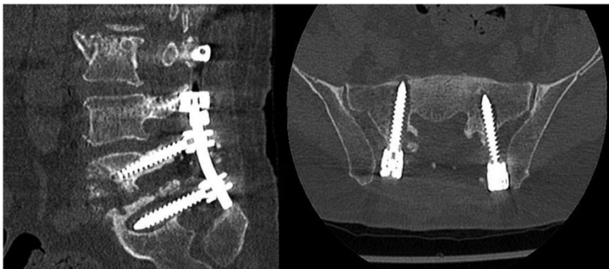
Fig. 2 Left sagittal and right axial computed tomography scans showing signs of S1 pedicle screws loosening, mainly on the right side.