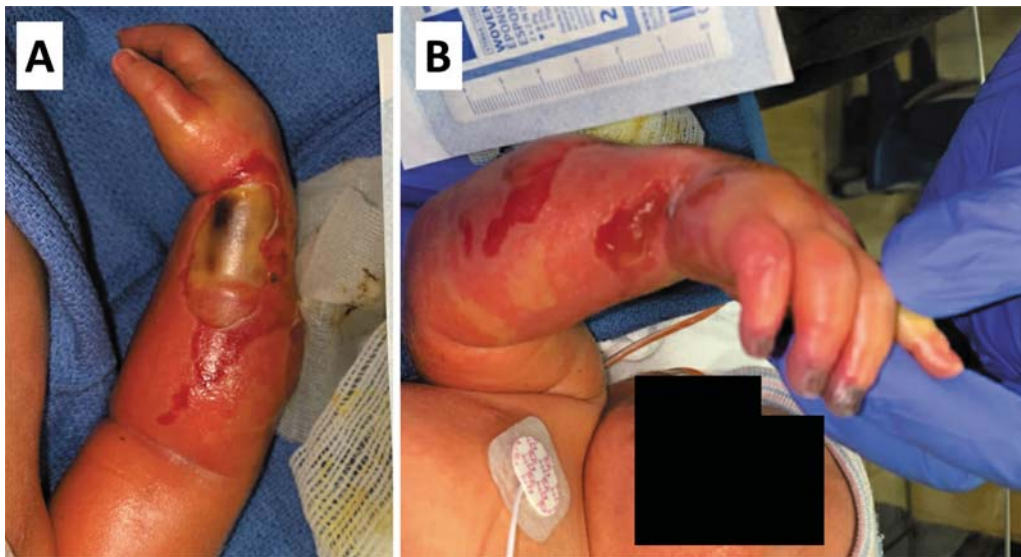
Fig. 1 (A) Right forearm and (B) right forearm and right hand at level IV neonatal intensive care unit.

At birth, the infant was found to have extensive swelling over the right forearm and right hand with multiple blistering skin lesions. Over the next 24 hours, the right forearm and hand swelling continued to worsen and developed decreased perfusion of the right distal digits that prompted the transfer to a level IV neonatal intensive care unit for further evaluation and possible surgical intervention.