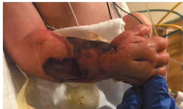
Fig. 2 Right forearm and hand after fasciotomies and carpal tunnel release.

Postoperatively, right brachial, radial, and ulnar blood flow were all detected via Doppler. A brain magnetic resonance imaging/magnetic resonance angiography/magnetic