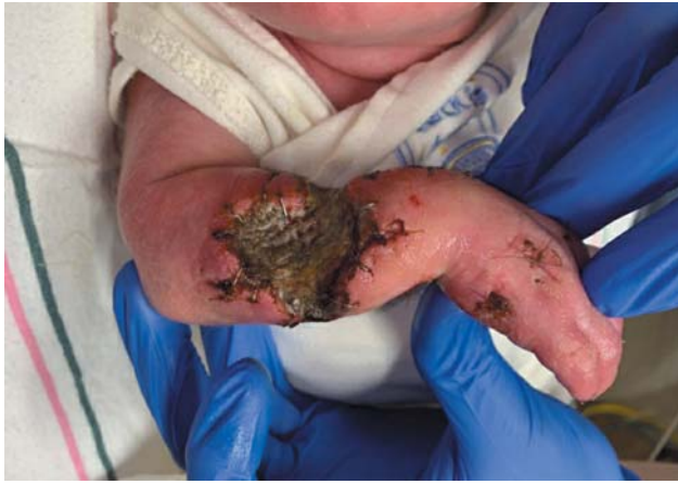
Fig. 3 Right forearm after second debridement and allograft placement and distal third, fourth, and fifth digit amputations.