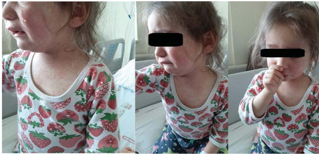
Fig. 1 The maculopapular rash of the patient.

resulted negative. The pharyngeal swab was positive for COVID-19. The other family members were tested negative after that result, but the family was isolated after the patient hospitalized. Hydroxychloroquine was added to treatment. Her abdominal ultrasonography and thorax CT were normal. In the following laboratory tests, D-dimer was 3,600 ng/mL, procalcitonin was 90 ng/mL, and CRP was 60 mg/L; there still was lymphopenia (500/ \mu L) and thrombocytopenia (90,000/ \mu L). She was referred to the pediatric infectious diseases clinic. At the follow-up, the laboratory parameters began to normalize and in the 7th day repeated pharyngeal swab was negative, laboratory parameters were normal, and the rash disappeared. She was not given IVIG or lopinavir/ritonavir. After recovery, she was discharged. She and her family were isolated for 14 days.