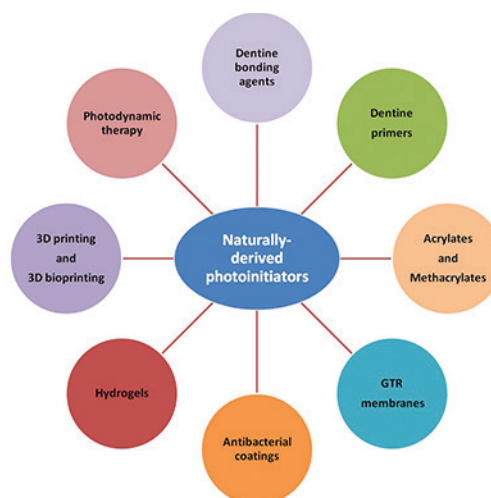
Fig. 1 Uses of naturally derived photoinitiators for dental and biomaterials applications.

An electronic search was done using MEDLINE/PubMed and Scopus databases using the keywords naturally derived, bio-sourced, photoinitiators, dental, biomaterials, 3D printing, and 3D bioprinting, and using operators or modifiers such as AND, NOT, and OR with the different keywords to review the potential naturally derived PIs for dental and biomaterials applications. Articles were chosen according to the following inclusion criteria: full text available or obtained in English language and the applications are for either dental or biomaterials uses. Structure of each naturally derived PI is shown in (► Fig. 2) and the type, color, and uses of each are summarized in ► Table 1.