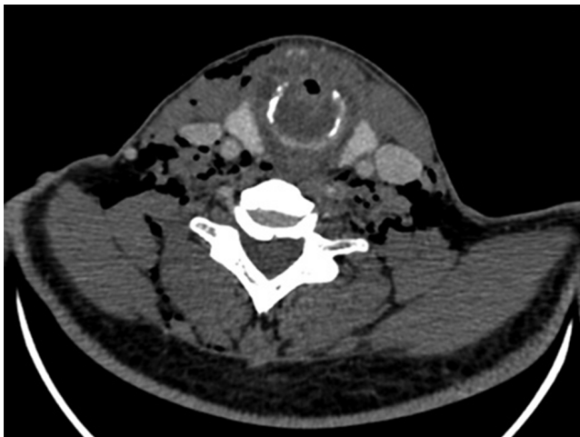
Fig. 3 Computed tomography of adenocarcinoma involving the subglottis causing significant airway compromise.

NIAC usually shows a seromucinous phenotype and is now considered a diagnosis of exclusion. 2-4 However, there are ongoing studies that aim at early histopathological diagnosis of this clinical entity.