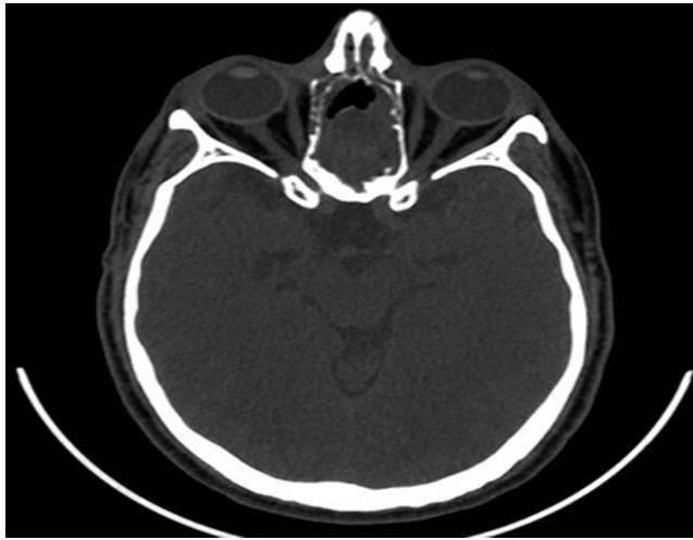
Fig. 1 Computed tomography of sinonasal adenocarcinoma with erosion of the cribriform plate.