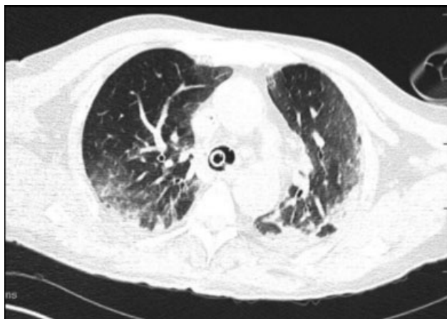
Fig. 3 Postoperative axial chest computed tomography scan exhibiting multilobed ground-glass opacities, suggestive of SARS-CoV2 infection.

intensive care unit (ICU), and another nasopharyngeal swab RT-PCR test was performed postoperatively, which was positive for SARS-CoV2 infection. During the hospitalization, respiratory symptoms were treated with ceftriaxone, azithromycin, oseltamir and hydroxychloroquine. After 12 days of mechanical ventilation, and 15 days of ICU, the patient was allocated to the infirmary. He showed improvement of his previous neurological deficits (showing left hemiparesis grade IV +). He was discharged after 19 days of hospitalization, with resolution of the respiratory condition and improvement of the functional status (modified Rankin Scale [mRS] of 3). The histological analysis diagnosed GBM (WHO grade IV), and the patient was referred to the clinical oncology department for planning adjuvant therapy.