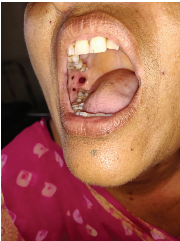
Fig. 1 Purpura on the right posterior buccal mucosa.

Rifampicin is the most common antitubercular drug for the causation of thrombocytopenia. 10 Rifampicin-induced thrombocytopenia involves antibody-mediated platelet destruction. 11,12 Binding of drug to the platelet surface causes a conformational change in a surface protein that leads to