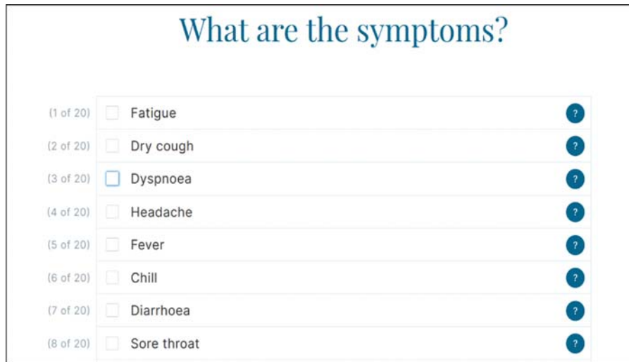
Fig. 2 Screenshot of the COVID-19 mini-repertory app. Explanation of symptoms could be obtained by clicking on the question mark to the right of the symptom.

The output of the app was ‘Strong indication for Bryonia’ and this was indeed the medicine that was prescribed by the clinician. An experienced homeopathic practitioner would probably recognise the medicine at first sight because of symptoms such as ‘irritable from cough’, ‘aversion to company’, ‘thirst for large quantities’ and ‘headache from cough’, which are not included in the app. However, with the combination of three symptoms, ‘thirst’, ‘dry cough’ and ‘headache’, the app would already have returned a ‘Moderate indication for Bryonia’. This results from the following LR’s for Bry : LR = 3.31 for thirst; LR = 1.43 for dry cough; and LR = 1.41 for headache. The combined LR for these three symptoms is 3.31 \times 1.43 \times 1.41 = 6.67 , high enough for a ‘moderate indication’. ‘Chest pain < cough’ adds LR = 3.61 and ‘Cough < talking’ LR = 1.47, rendering a combined LR = 35.4, representing a strong indication.