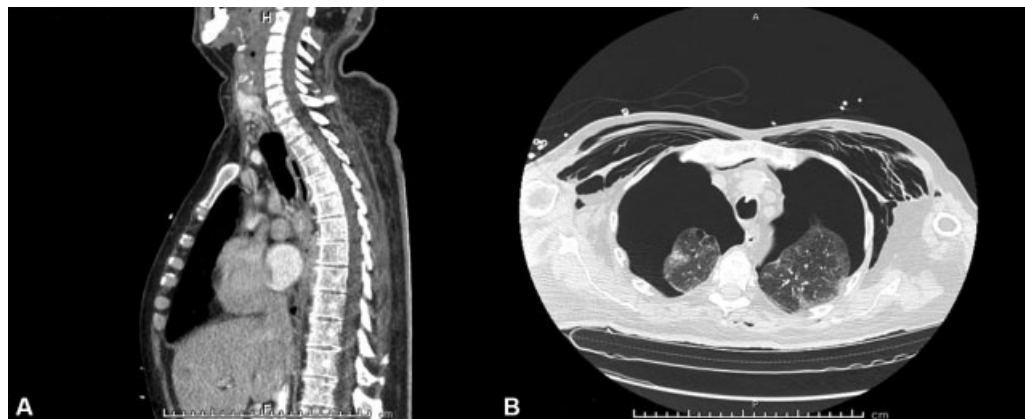
Fig.2 Computed tomography scan showing large tracheoesophageal fistula (A) and bilateral pneumothorax (B).

of the trachea during the maneuver leading to a theoretical risk of aerosolization and favoring the surgical approach during the SARS pandemic. 19,20 On the other hand, percutaneous approaches have evolved over time as well as devices to perform bronchoscopy, such as remote monitors and closed circuits to seal the airway and prevent air diffusion and desaturation during the procedure. 21 Furthermore, PT can be performed as a bedside procedure, thus avoiding moving the critically ill patient to the operation room. Moreover, PT has also been demonstrated to be safer in terms of bleeding complications compared with the surgical procedure 22 : a recent report about PT in COVID-19 patients discloses increased hemorrhagic complications. 15 We did