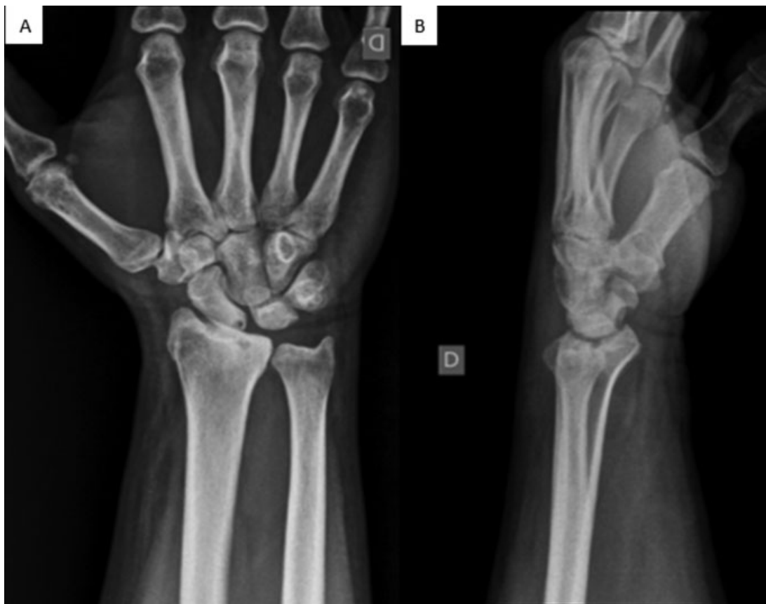
Fig. 3 Posteroanterior (A) and lateral (B) radiographies of the distal portion of the right radius showing vicious consolidation with radiocarpal joint step and loss of normal radial volar tilt.