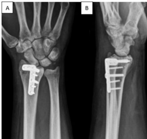
Fig. 5 Posteroanterior (A) and lateral (B) radiographies 4 weeks after surgery. Joint step reduction and enlargement of the radial articular surface as performed during the preoperative planning in a PLA model.

The use of 3D prototyping in orthopedic surgery allows for a better 3D understanding of the fracture or its vicious consolidation. Visualization and manipulation of models, which are true to the patient's anatomy, help surgical programming and intraoperative decision making.