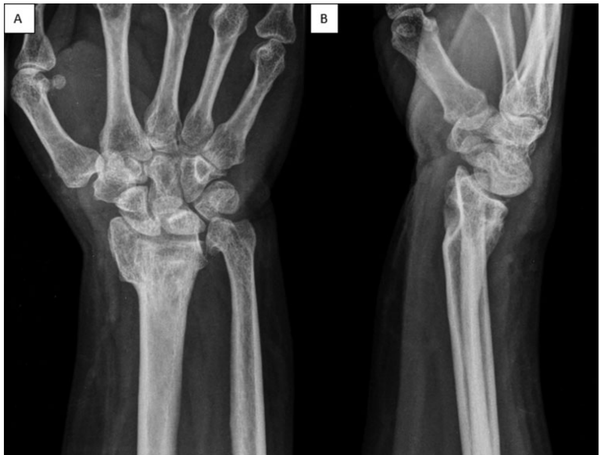
Fig. 1 Posteroanterior (A) and true lateral (B) radiographies of the left wrist showing vicious consolidation with dorsal deviation, radial shortening, ulnar head deformity, and adaptive carpal instability.

In the early 1980s, Charles Hull developed and conceptualized 3D printing, allowing the creation of objects based on material deposition layer by layer. Since then, 3D printing advanced and models present better resolution, faster production, and lower cost; in addition, there is a greater variety of materials for printing. 7