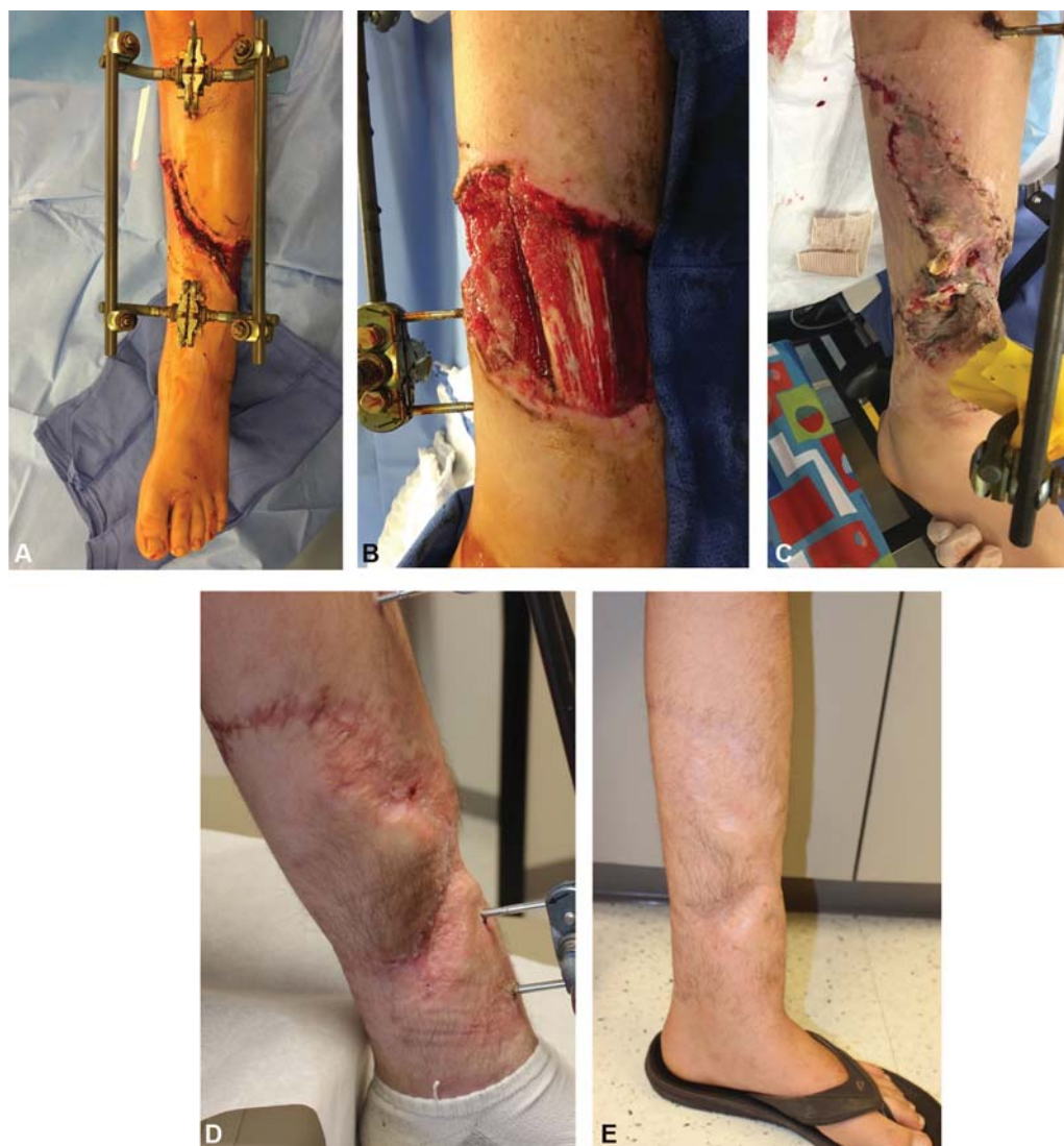
Fig. 2 Case 1: Gustilo IIIB open tibial fracture. A 14-year-old male underwent initial sharp debridement and stabilization of a Gustilo IIIB open tibial fracture with an external fixator (A). Exposed tibia without periosteum was covered by undermining of soft tissue envelope and advancing using tension sutures (B). A single dehydrated human amnion/chorion membrane (dHACM) was applied over the exposed anterior tibia, adequate granulation tissue developed, and split-thickness skin grafts (STSG) was successful (C). The wound completely healed in 3 weeks and remained stably closed at 18-month follow-up (D, E).

Alternatively, injuries such as those to the plantar surface often require ultra-thin flaps that may be unavailable given the growing epidemic of obesity. In the pediatric population, smaller vessel size and increased arterial spasm make free tissue transfer challenging even for experienced microsurgeons. 7–10 Multiple studies have shown that anastomoses involving vessels with a diameter < 0.7 mm increase the risk of flap failure due to the technical difficulty. 5,6,19 Furthermore, postoperative activity restrictions and positioning requirements are notoriously difficult to impose on pediatric patients, yet crucial for flap survival. In contrast, rLS does not require microsurgical expertise but also preserves all fLS options as reconstructive lifeboats.