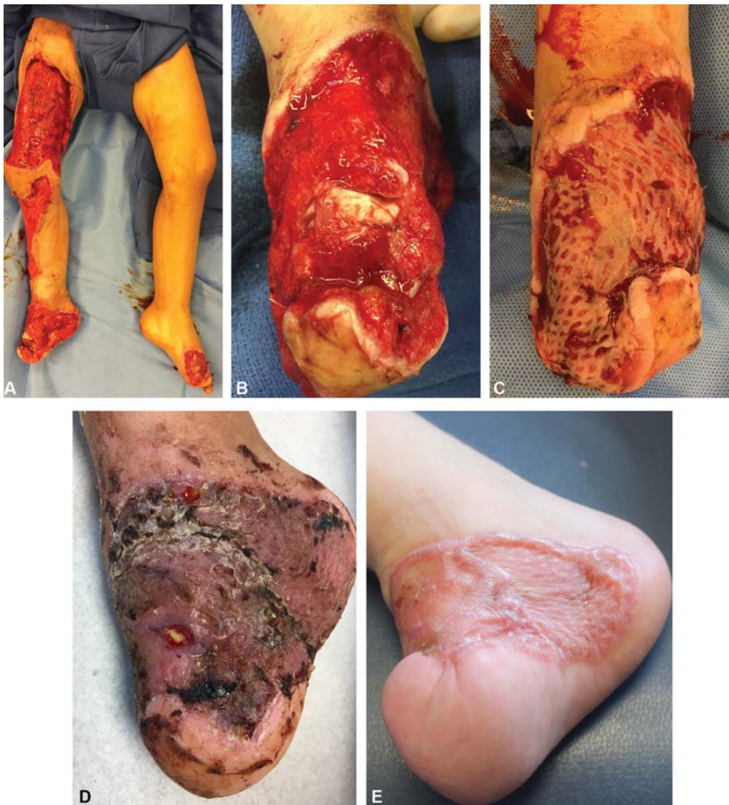
Fig. 3 Case 2: Exposed metatarsal joint. A 3-year-old male with exposed cartilage and tendon on bilateral feet following lawn mower injury. Regenerative limb salvage (rLS) was performed. He underwent debridement of all necrotic tissue (A, B). One dehydrated human amnion/chorion membrane (dHACM) treatment was performed followed by split-thickness skin graft (C). On postoperative day 5, a small area ( < 0.1 \text{ cm}^2 ) of exposed cartilage persisted (D). A second treatment of dHACM was applied for definitive wound closure. Two weeks later, the wound was clean and fully healed with no palpable cartilage. The wound remained stably closed at 2-month follow-up and he has resumed ambulation (E).