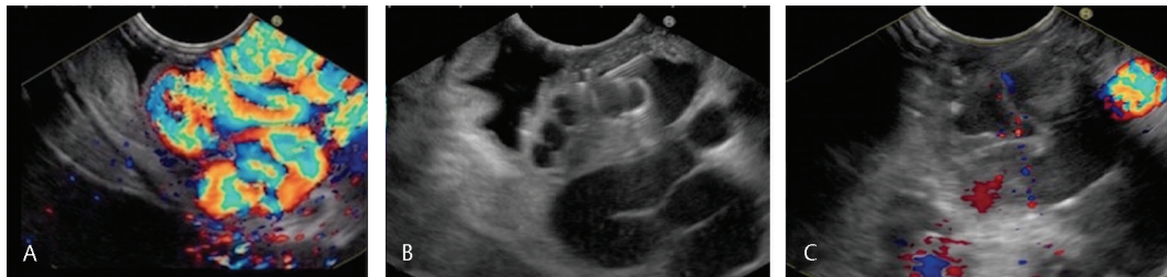
Fig. 2 Endoscopic ultrasound (EUS) imaging of gastric varices. (A) Color Doppler showing active flow in gastric varices and (B) coil deployment in gastric varices endosonographically; (C) lack of color Doppler signal on EUS suggests obliterated gastric varices.

months follow-up, only one patient rebled that was controlled by conventional CYA glue alone.