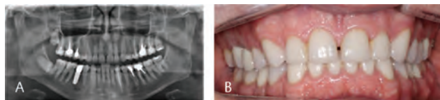
Fig. 6 Patient B. State of the oral cavity in 9 years after the treatment. (A) Orthopantomography and (B) intraoral photograph.

TMJ and occlusive disorders, and the influence of occlusion on the state of teeth and periodontium. Also, the assessment of all characteristics after the prosthetic restorations in the process of further patient observation is extremely important. 2,4-7