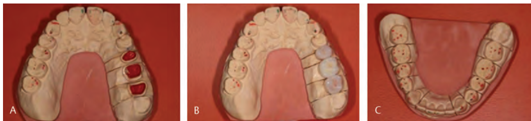
Fig. 4 Reconstruction of frontal restriction, canine guidance, and retrusion restriction on the first maxillary and mandibular molars. (A) Paths of frontal and canine guidance on the canines and maxillary incisors; (B) manufacture of all-ceramic restoration on teeth 25, 26, and 27; (C) three-pointed contact in maxillary and mandibular cusps and intercusp fissures of the mandibular molars.