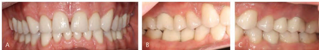
Fig. 5 Patient B. The final result of the treatment. (A) Frontal plane; (B) occlusal plane of the maxillary teeth; and (C) occlusal plane of the mandibular teeth.