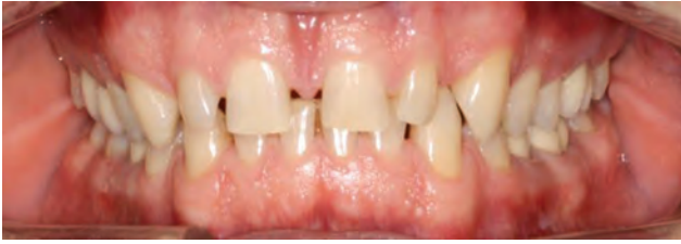
Fig. 1 Patient B. Intraoral photograph before treatment.

features: a deep incisal bite, diastemata, a decrease in the interincisal angle, a mismatch in the midlines, and dental class I.