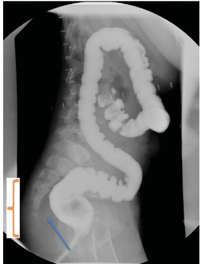
Fig. 2 Contrast enema with absence of haustrations in the distal segment denoted by “].” The arrow denotes widening of the presacral space.

Our review of the post pull-through contrast enema ( Fig. 1 ) came to a different conclusion. We felt the study showed a 180-degree twist in the distal pull-through ( Fig. 1 ). This was demonstrated by the shift in the antimesenteric border of the colon. We also felt that the twist was intermittent since the contrast study did not demonstrate bowel dilatation proximal to the twist. Since this patient had a previous Soave pull-through, it was also important to note the presence of presacral space widening ( Fig. 2 ), which could be indicative of a Soave cuff; however, this was not evident on the physical exam. Our repeat examination under anesthesia and rectal biopsy confirmed the findings from the outside hospital of no circumferential Soave cuff; however, we were unable to pass a digit or a Foley catheter freely into the pelvis. Given the recurrent obstructive symptoms that occurred prior to the ileostomy and the concerns on the contrast study and exam, we offered the patient a reoperation. We performed a Swenson type redo transanal only pull-through and upon transanal mobilization the distal pull-through was noted to have a 180-degree twist, with the mesentery on the anterior side when it