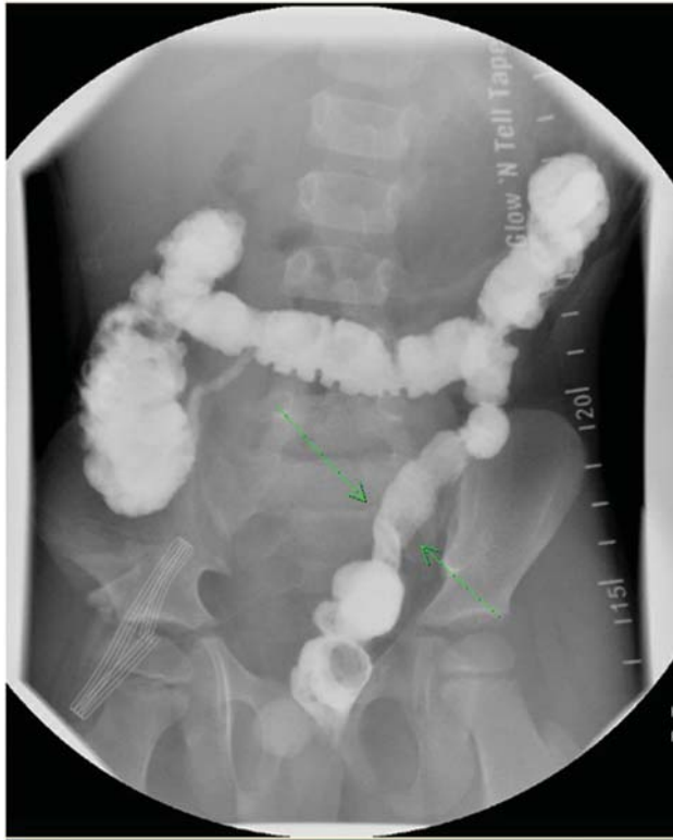
Fig. 1 Postevacuation film showing a twist of the pull-through demonstrated by a shift in the mesenteric border of the pull through segment.

contrast study was felt to be normal. The patient also underwent colonic manometry testing which showed diffuse colonic dysmotility. Based on this result, an ileostomy was recommended.