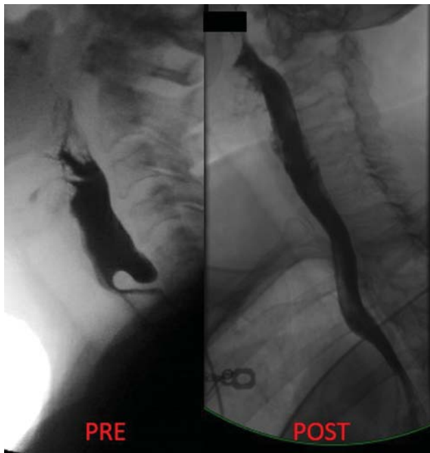
Fig. 1 Lateral view of preoperative and postoperative esophagram with complete elimination of the diverticulum after Zenker's diverticulum per oral endoscopic myotomy.

endoscopic myotomy (Z-POEM) were included. ZD was diagnosed with both endoscopy and radiological studies (► Fig. 1A ), and all patients were symptomatic from the ZD.