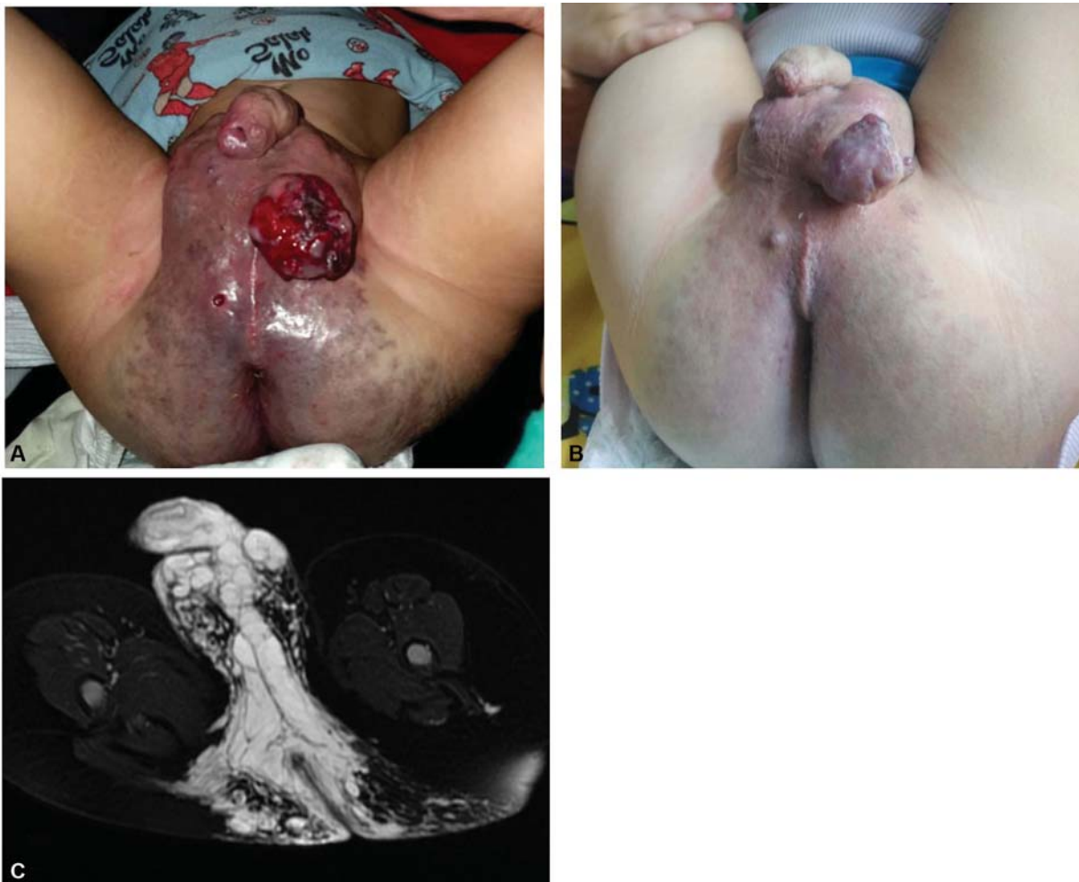
Fig. 1 A 21-month-old boy presenting with extensive venous malformation in the perineum and pelvis. (A) Complicated presentation with chronic bleeding from a fungating skin ulcer. (B) After 3-month treatment with oral sirolimus showing marked improvement of skin lesions. (C) Pelvic magnetic resonance imaging (T2WI with fat suppression): axial cuts through the perineum to demonstrate the extension of the lesion that appeared as hyperintense dilated venous lakes.

A 21-month-old boy was referred to our vascular anomaly clinic with extensive vascular malformation in the perineum and pelvis (–Fig. 1). At day 2 of life, he had bleeding from a scrotal lesion for which a trial of surgical ligation failed resulting in a fungating skin ulcer with persistent chronic bleeding (–Fig. 1A). He had a history of recurrent attacks of severe bleeding per rectum necessitating hospital admission and blood transfusion (three attacks since the age of 7 months). Attacks of bleeding per rectum accompanied severe straining at defecation. Before referral to our clinic, the patient was given a generic diagnosis of hemangioma and started oral propranolol with no improvement.