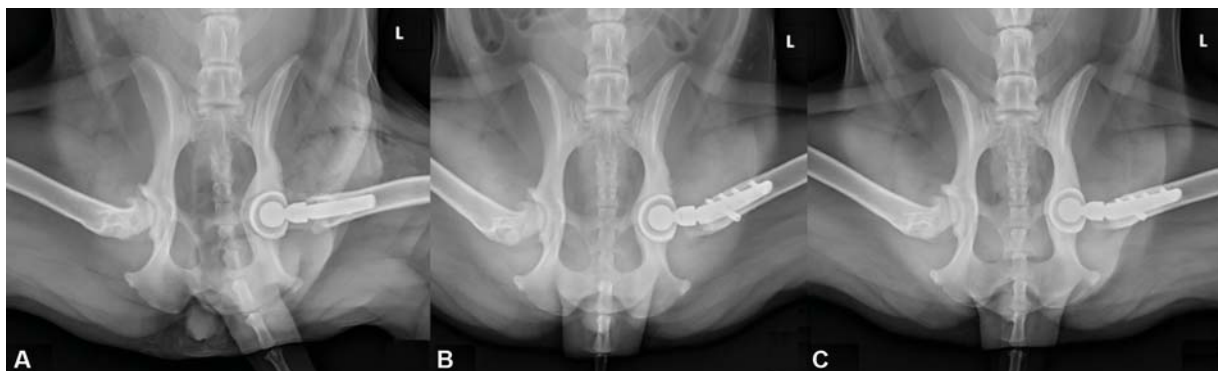
Fig. 2 (A) Immediate postoperative radiographs demonstrating moderate polar gap. (B) Eight-week postoperative radiographs demonstrating marked reduction in polar gap depth. (C) Twenty-four-week postoperative radiographs demonstrating gap fill.