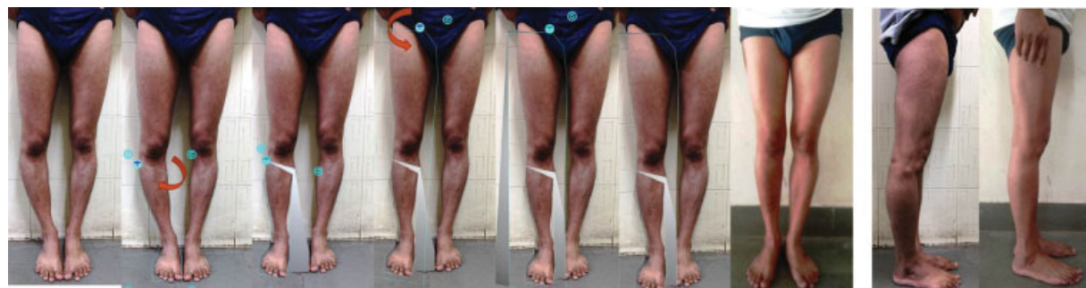
Fig. 4 Simulation of correction on patient's clinical photograph.

The present work was approved by the institutional ethics committee and informed consent was obtained from all individual participants included in the study.